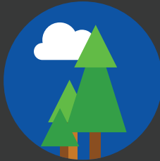
The Great Outdoors

Data* reported from the American Association of Poison Control Centers' National Poison Data System (2016)**