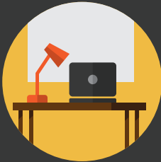
On the Job